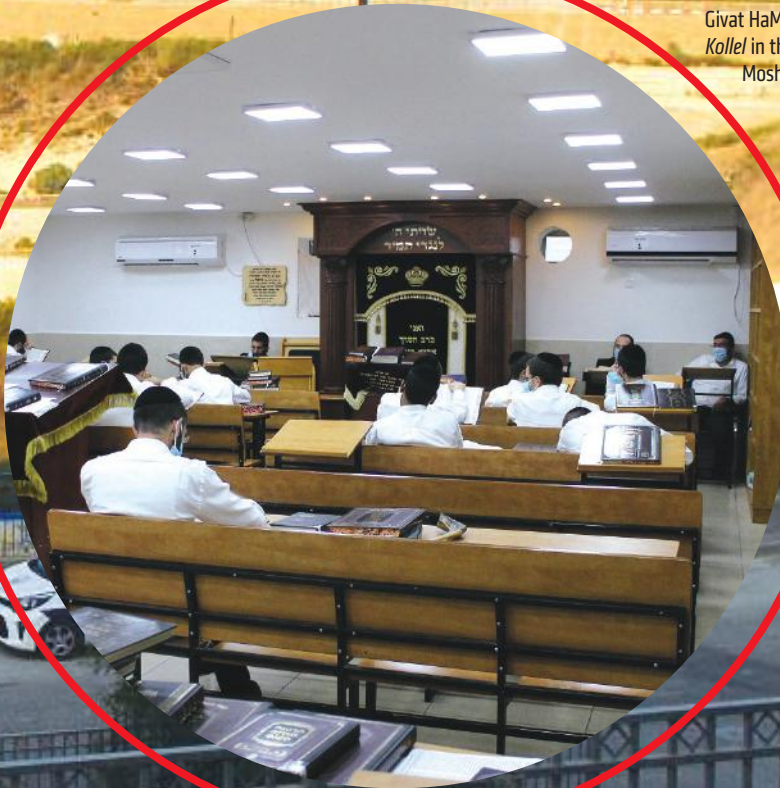
Givat HaMoreh – Kollel in the Ohel Moshe shul.